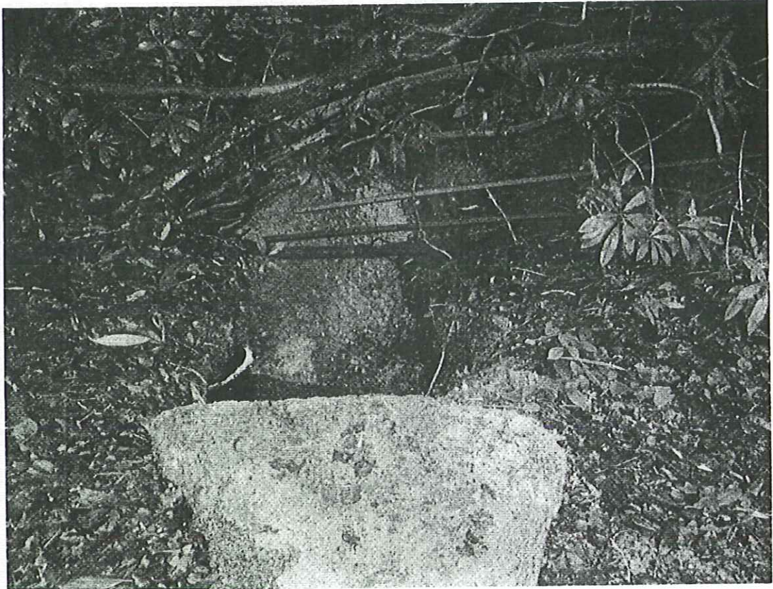
Burn adjacent to road