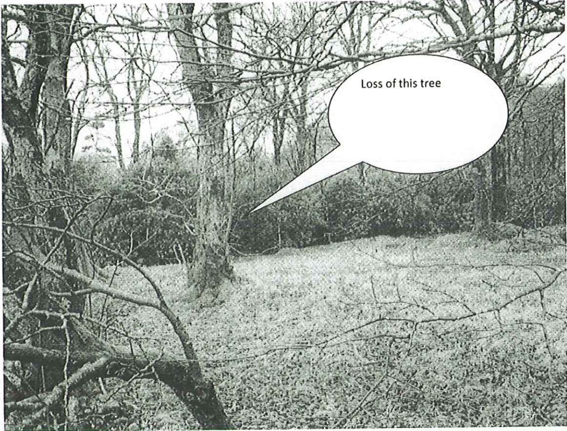
possible loss of tree to the right