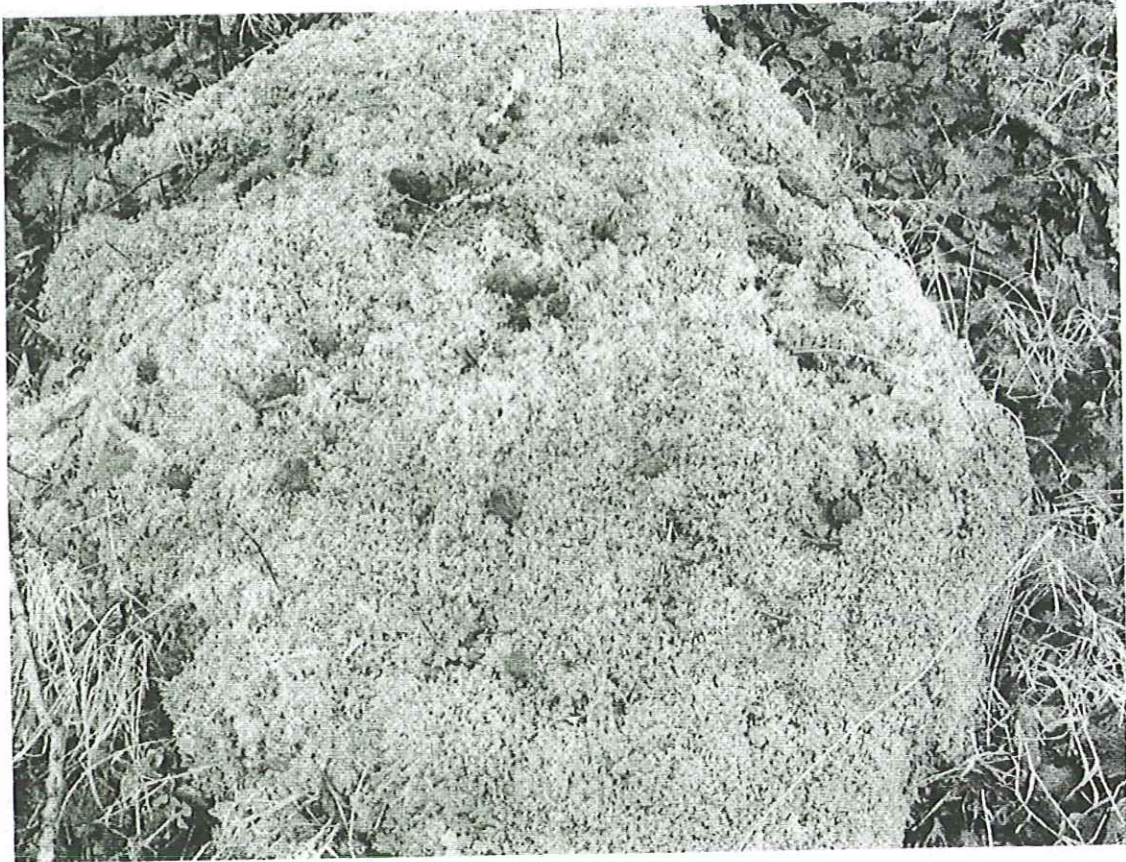
Fern and spagnum moss with beech nuts