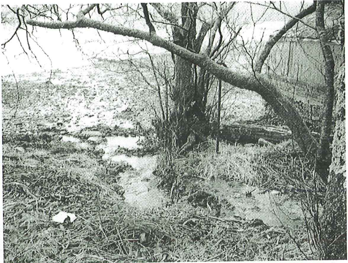
Out flow of burn to the sea