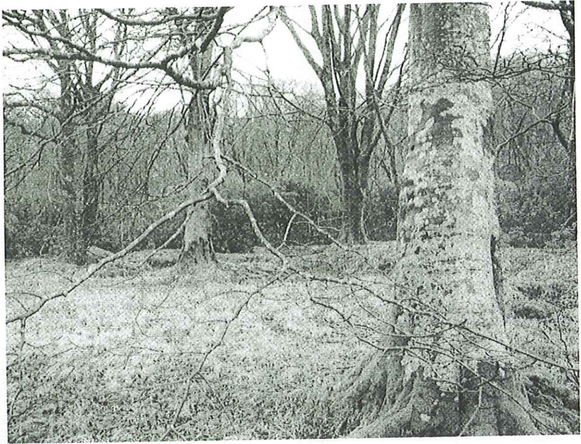
site of house