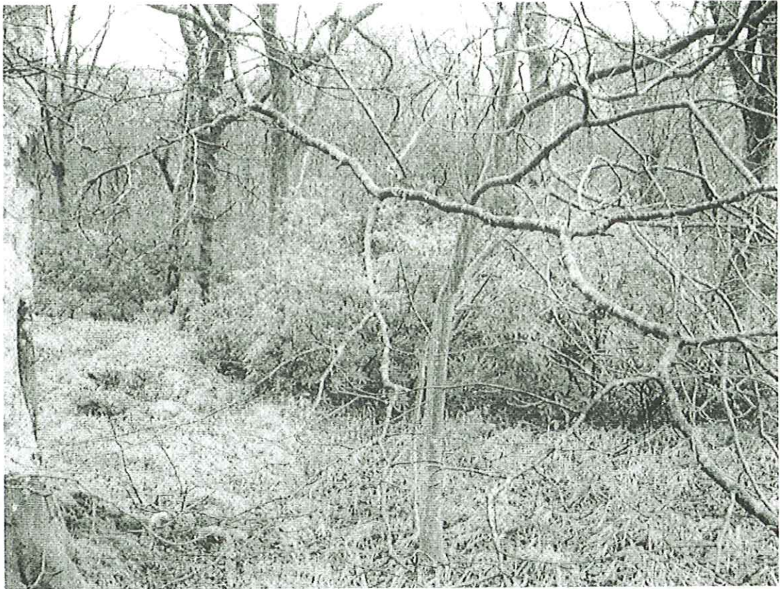
edge of house and proposed parking are