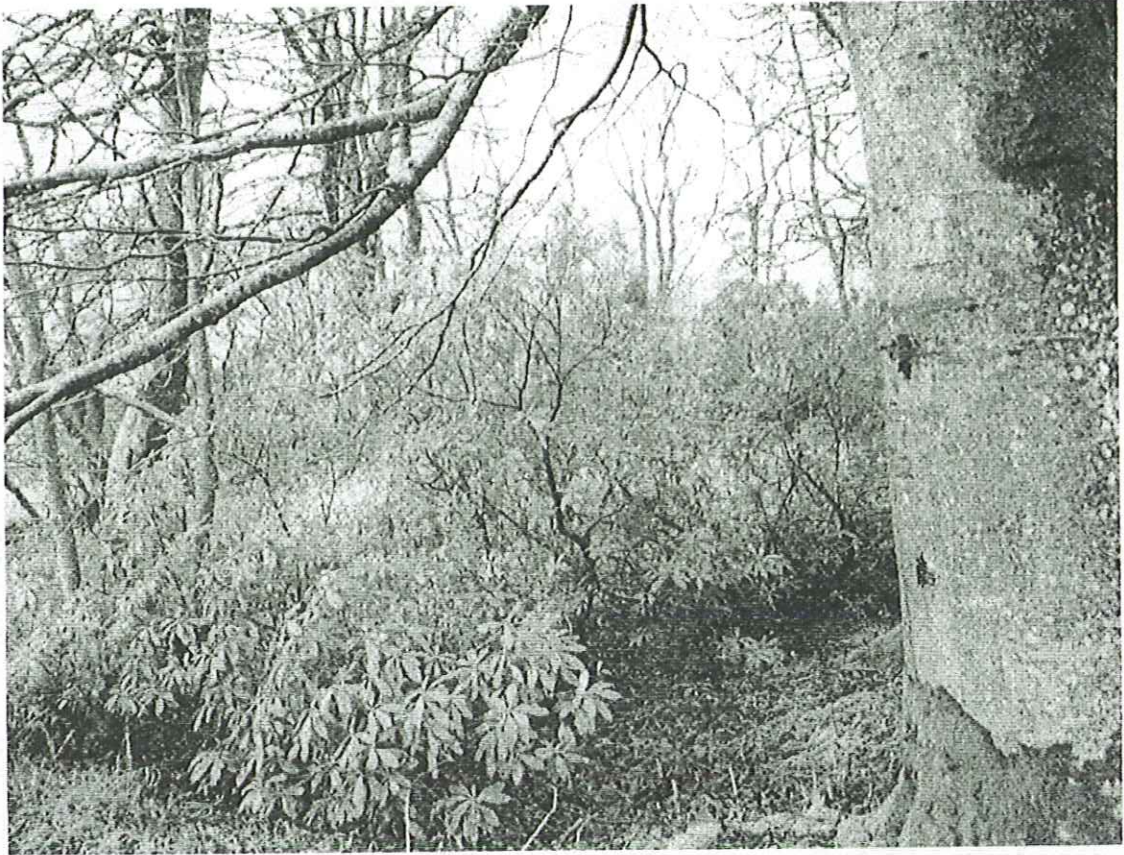
evidence of rhododendron ponticum