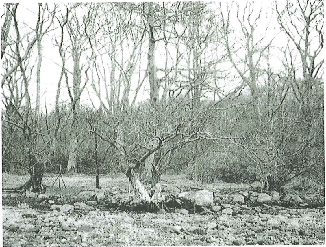
proposed site of house behind front tree edge.