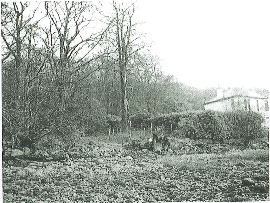
view from beach