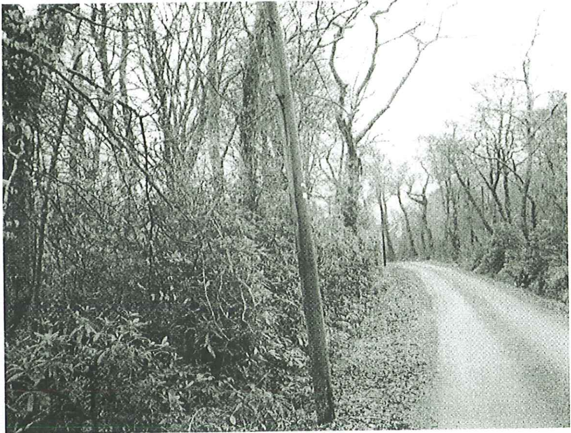
to road Colintraive