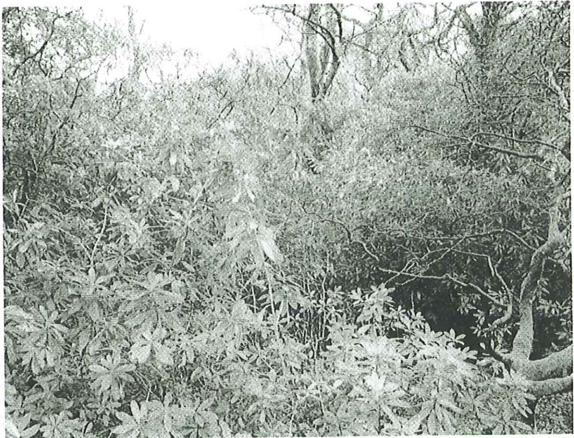
Acess through Rhododendron p.